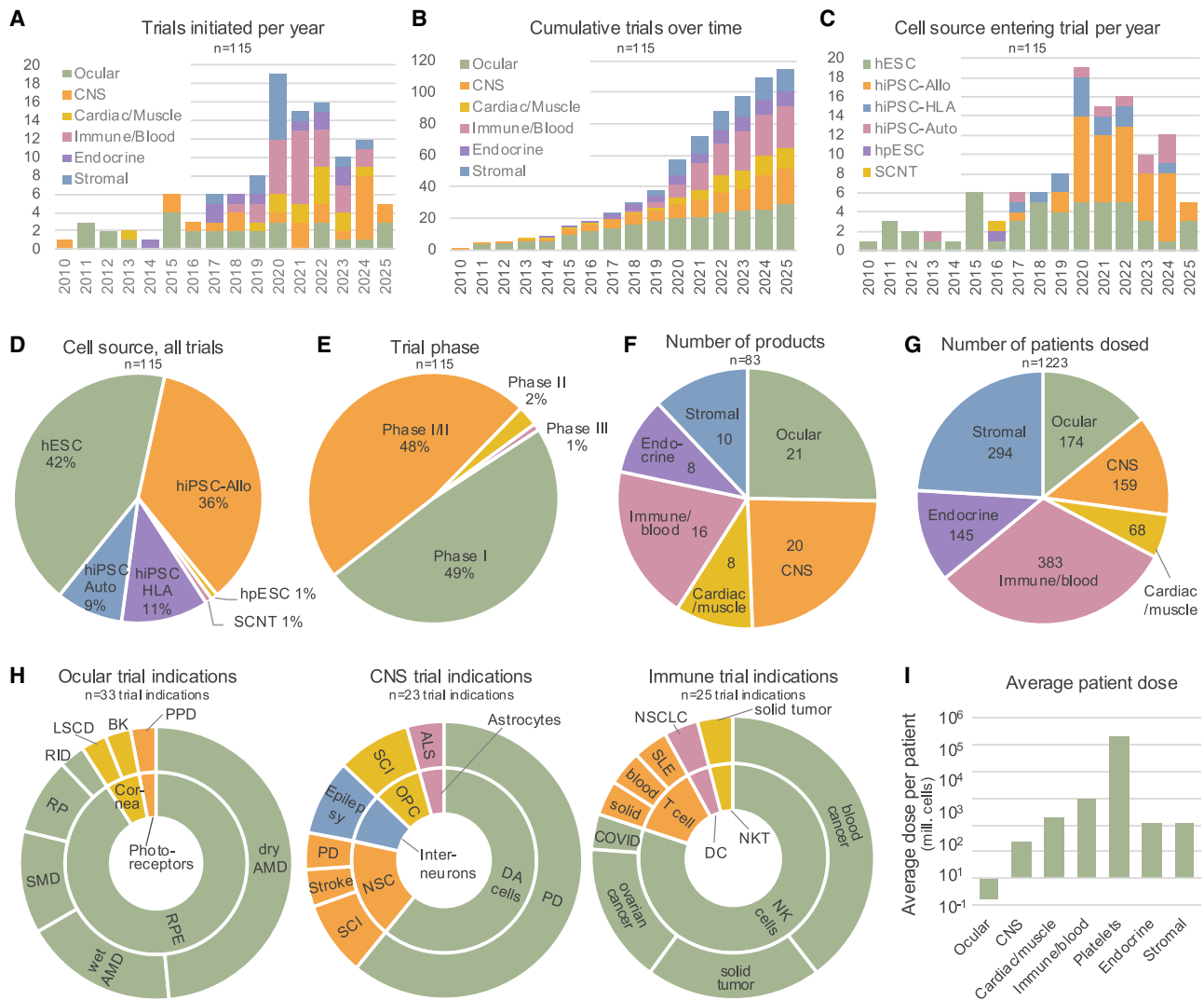
Figure 2. Overview of hPSC trials and dosed patients

(A) Number of trials initiated per year, since 2010, color-coded for product type. Numbers for 2025 are incomplete estimations based on currently approved trials. (B) Cumulative number of initiated hPSC trials from 2010 to 2025, color-coded for product type.